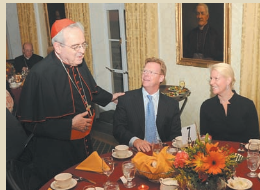
Cardinal Rigali greets guests at the Cardinal's Society dinner on October 14.

to Heritage of Faith ~ Vision of Hope and thank them for their support of the campaign. "Let us never grow tired of doing good," he said, citing the words of Saint Paul.