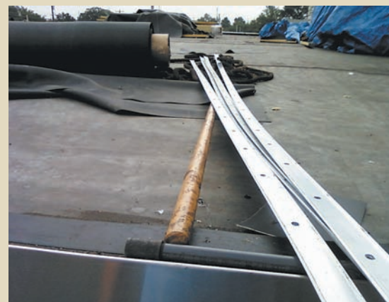
The parish raised 138% of their goal, providing enough funds to replace the church roof and focus on future restoration projects.

Within six months of completing a parish campaign, pastors receive a statement from the Archdiocese outlining the amount raised by the parish and the amount paid on those