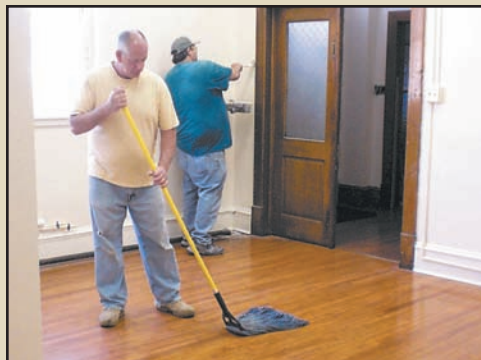
Workman put the finishing touches on the restoration of the church basement auditorium at Sacred Heart Parish, Phoenixville. The parish raised 138% of their goal, providing more funds to address renovation and repair projects in the century-old Church.